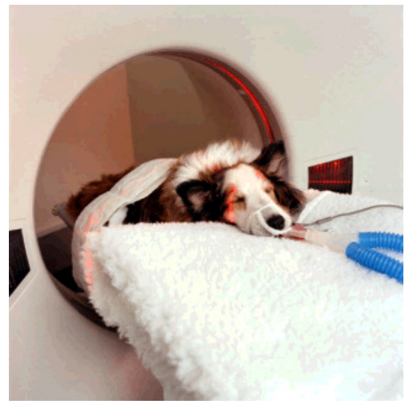
Dog having a CT scan

Canine idiopathic vestibular disease (also called old dog vestibular disease) and its feline counterpart, feline idiopathic vestibular disease, begin acutely and resolve acutely. Usually improvement is evident in 72 hours and the animal is normal in 7 to 14 days, although occasionally a head tilt will persist.