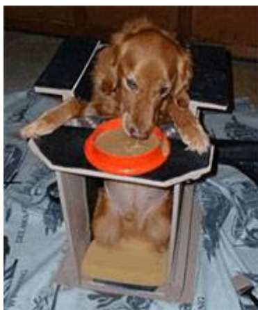
Isaac in Bailey Chair

To minimize the effect of gravity on the food (and thus minimize regurgitation) you must train the dog to eat in an elevated position. Elevated feeding can be accomplished in several ways and it is of such importance that we would like to review it further. For many dogs a stepstool with three or so steps works well. The food is placed on the top platform and the dog must eat with his forefeet on one of the upper steps and his rear feet on the lower steps. Ideally, the pet should be kept in this position for 10 to 15 minutes after the meal.