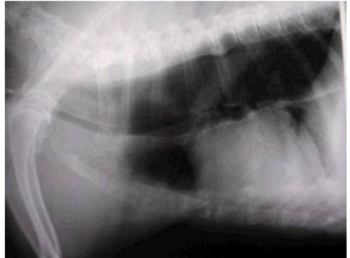
Yellow lines trace the outline of a megaesophagus in this canine chest radiograph.