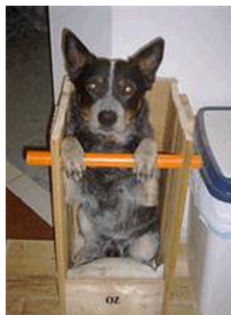
Oz in Bailey Chair

Alternatively, a Bailey Chair can be constructed. The Bailey Chair was invented by the owners of a megaesophagus dog named Bailey. It allows for upright feeding and, even more helpful, maintaining the dog in the upright position 15 minutes or so after eating to help the food reach the stomach. The chair is relatively easy to construct and the family who invented the chair is happy to send an instructional video. They can be reached through the Yahoo! Megaesophagus Newsgroup at http://pets.groups.yahoo.com/group/megaesophagus .