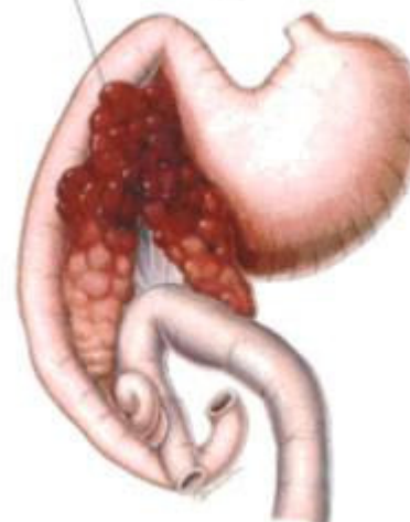
Swollen, inflamed pancreas with areas of hemorrhage

Also, there is a syndrome called Weber-Christian syndrome